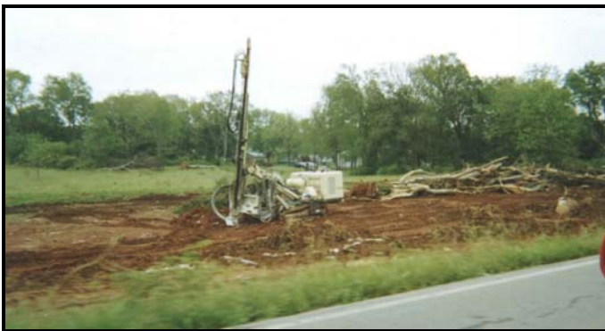
Construction on Manson Pike