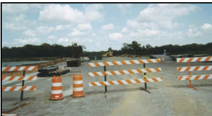
Construction on Thompson Lane