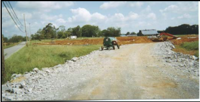
Construction on Manson Pike

Development continues to escalate along Thompson Lane with a variety of commercial operations now located on original battlefield acreage. The businesses are less than one-half mile from the current Stones River National Battlefield boundary.